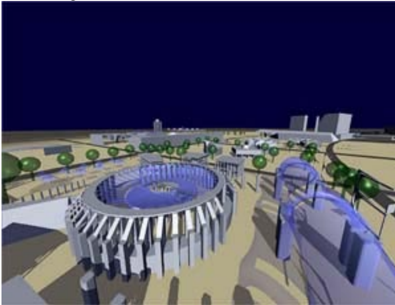
Figure 3: Auroville Detail

combined with the experience gained from other concurrent engineering training sessions using interdisciplinary teams, should serve to engage the students in steering the direction of Auroville development.