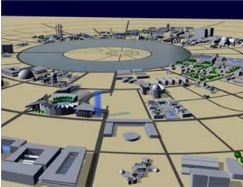
Figure 1: Initial seeding of Auroville

studios. A third aspect of the pedagogy is the introduction of interdisciplinary teamwork. Auroville, with its rapid growth and complexity, serves as a platform for these secondary and tertiary issues. That is to say, the introductory CAAD courses serve to populate the city. Advanced CAAD courses use the city structure to commonly create the city's infrastructure. Lastly, the city serves as a common platform for related disciplines. In this way, Auroville is a microcosm simulating the real issues affecting the real cities we as Architects, Planners and citizens deal with.