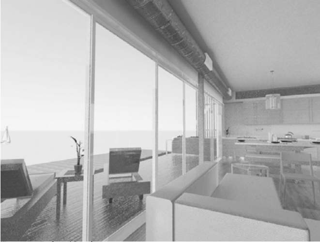
Figure 5: Indoor/Outdoor connection