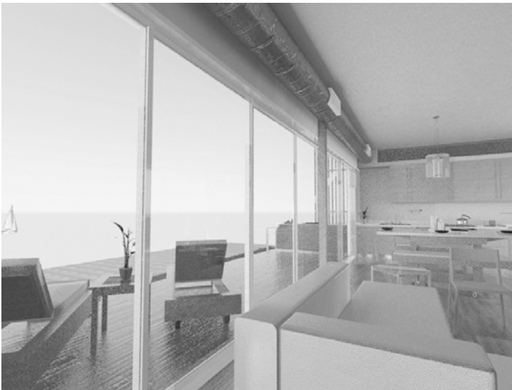
Figure 2: Indoor/outdoor space by Rudolph