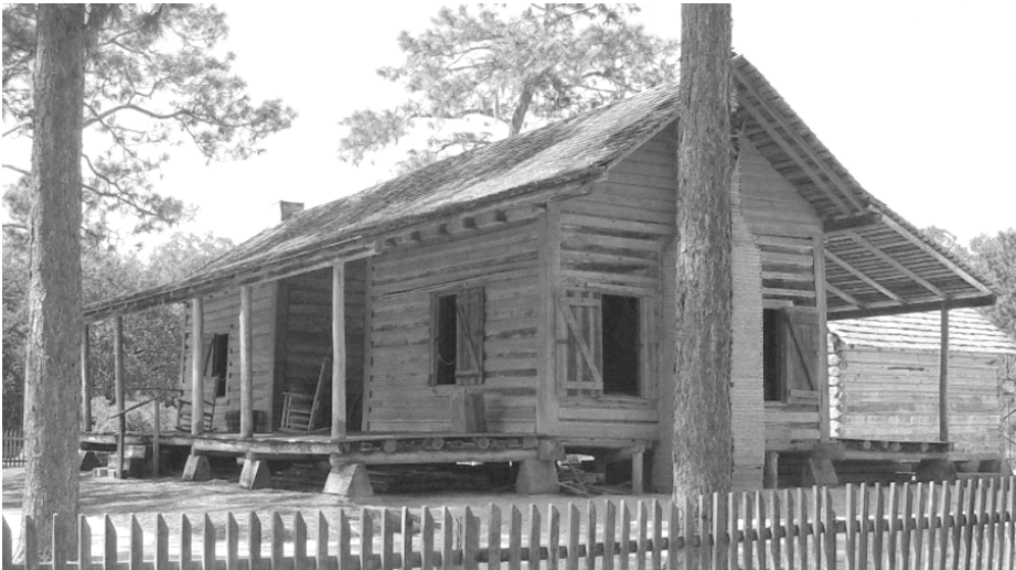
Figure 1: Typical Florida Cracker House

Cracker houses were built of wood and metal, materials with low thermal mass that are well suited to the Florida climate. Given that the Crackers were adapted to Florida's climate and their thermal comfort zone must have been several degrees higher than ours is today, one can imagine that the Cracker house with its wide shady porches provided them with a reasonably comfortable living environment. Meanwhile, the architectural style of choice of the high society people vacationing in Florida in the late 1800's was not the humble wooden cracker house but the masonry and stucco style of the exotic Spanish Mediterranean. With masonry walls and heavy tile roofs that absorb heat, small windows that inhibit ventilation and minimal roof overhangs that allow the sun to bake the masonry walls, these houses were the antithesis of effective passive solar design in a hot, humid climate. But despite its lack of affinity for the Florida climate, the Mediterranean Revival style [Med-Rev] is