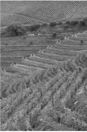
Figure 4: Patamares in Tabuaço.