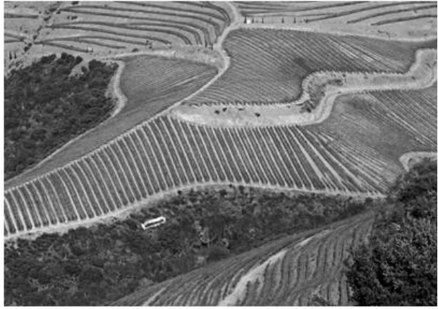
Figure 5: Patamares in Tabuaço. A new way of cultivating the vineyards, creating vertical lines, contributes to the ADV landscape layout.