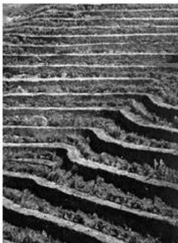
Figure 2: Terraces before the phylloxera plague.