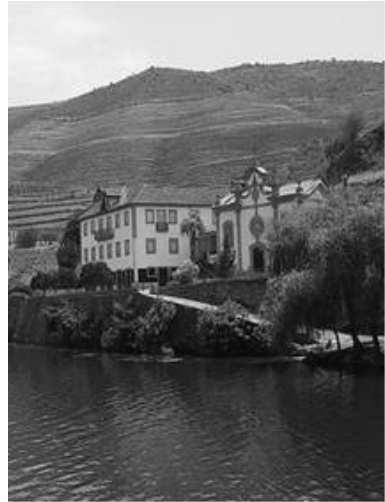
Figure 7: Quinta do Vesúvio Douro, one of the most impressive examples of quintas in the ADV landscape.

The religious buildings are not so expressive, scarcely placed on the territory, although the surrounding communities view them as significant landmarks.