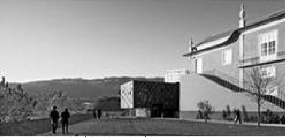
Figure 9: Douro Museum, Peso da Régua