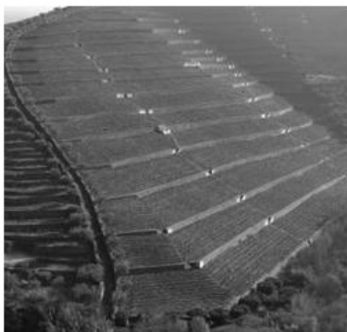
Figure 3: Terraces after the phylloxera plague in Valença do Douro. (Source: Miguel Flores, 2007).

These surveys reinforce the human effort and uniqueness of this particular landscape. The reaction to adverse morphological conditions and to the plague reveals the genius of a population and how this is connected to their collective identity.