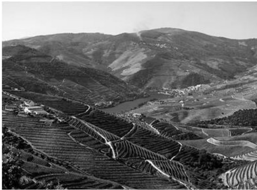
Figure 6: The ADV region: an overall view.