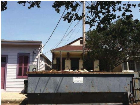
Figure 10: A dumpster outside a typical gutted house in New Orleans.

In the city of New Orleans, a man-made disaster was responsible for revealing the latent potential of public garbage flows. However, this issue—the problem of material waste and diminishing resources—transcends the geographic boundaries of the Crescent City. This project provides a proposition: that an inventory of endangered architectural gems, developed across regions and activated independently of crisis, could scale up to incite widespread environmental change.