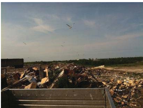
Figure 5: New Orleans' primary landfill, which abuts the Mississippi River watershed.

Yet despite the more than 22 million tons of construction and demolition debris generated by Hurricane Katrina in 2005, (Ardani 2007) material salvage operations served only a small fraction of the rebuilding community. 2 In New Orleans, salvaged building materials find new life only through a small number of enterprising organizations that rely entirely upon independent coordination with contractors and homeowners. 3 For every house that benefits from the selective deconstruction offered by these salvage operations, hundreds of other houses end up in the landfill.