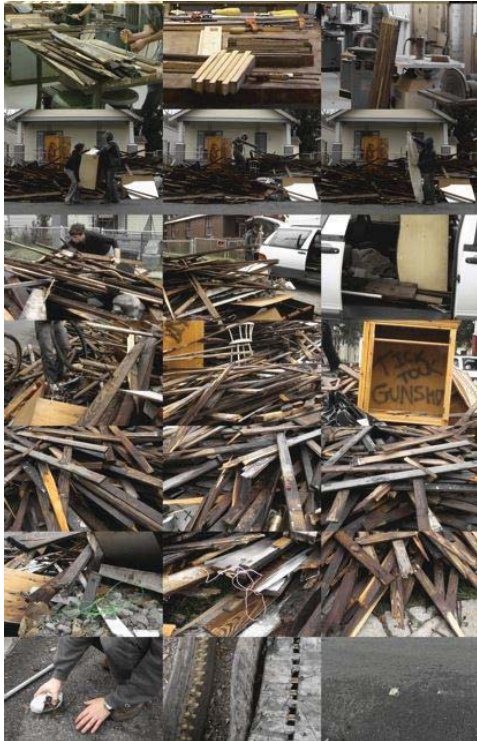
Figure 6: A process board developed by students.

While this massive resource-dumping may finally have been staunched by the gift of time in New Orleans, the dearth of salvaged building materials undoubtedly caused longer gestation periods for rebuilders. Students from the architectural salvage research team wanted to highlight this unfortunate loss. Believing that any city in today's resource-scarce environment, rebuilding or not, would benefit from more progressive material salvage practices, they saw this research as a form of public outreach, improving communication about architectural salvage.