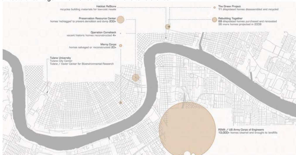
Figure 7: A resource map made by students for community use.

During this representational phase, these material findings were then translated into a material resource map, material quality lists, and a photographic essay that helped to tell the story of the pile's contents. In doing so, the students capably illustrated their findings, rendering the information accessible to the public. At this stage one of the most useful drawings emerged: a map depicting the recycling stations for architectural salvage in New Orleans for citizens to reference.