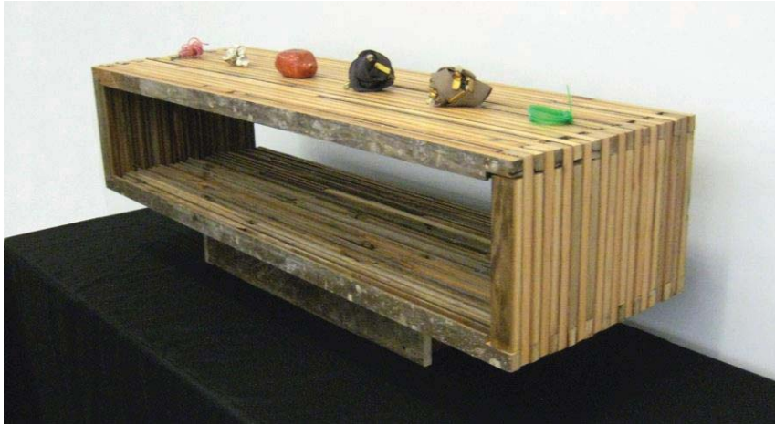
Figure 9: The end table on display for the community.