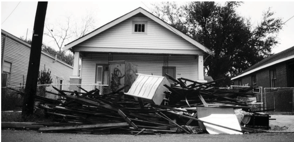
Figure 3: The trash heap, typical in post-Katrina New Orleans, studied by students. Source: (Clouse 2010)

In an effort to understand the impact of the enormous construction debris caches that materialized in the wake of Hurricane Katrina, a small team of students from Tulane's School of Architecture took to the streets to collect data. Together they worked to inventory products, categorize material properties, and map subsequent flows. They began by questioning the characteristics of abandoned building materials, targeting one trash pile along a street in a flooded mid-city neighborhood. Initially, they picked apart the heap of debris to determine the amount, weight, volume and type of refuse generated by a typical freshly-gutted house.