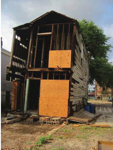
Figure 4: One typical house in New Orleans, awaiting renovation.

Once these architectural gems have been salvaged, the rest of the waste pile qualifies for a more traditional recycling route. Scrap wood, metals and glass could be separated and re-constructed. Organic matter would make rich compost. Toxic materials, such as asbestos, paints or poisons, might get quarantined in safe containers.