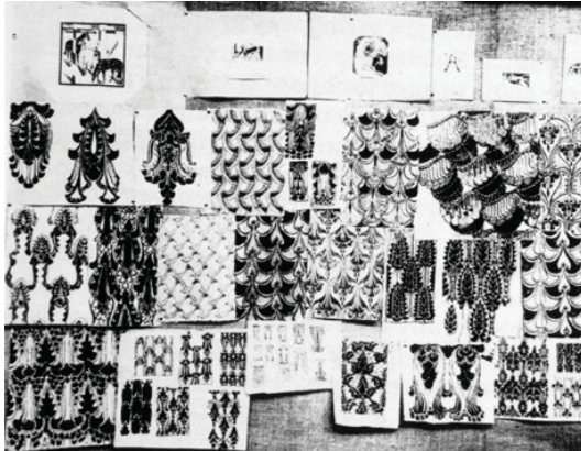
Figure 7: hand drawn exercises in abstracting nature from La Chaux des Fonds School of Art, ca. 1915.

And something like this must have been Le Corbusier's message to the students for whom he created this photomural. Such analogies were an essential part of his own early education in Switzerland, so much so that the photomural might be regarded as an 'advanced technology' version of the drawings of the patterns of nature that filled the walls of the School of Art studio that he taught there in 1915 (Figure 7). 20