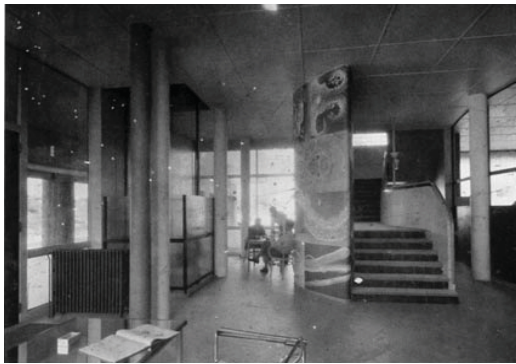
Figure 6: photomural on elliptical 'column' in lobby of Pavillon Suisse.

The photographs were first selected by Le Corbusier and Pierre Jeanneret from pre-existing photographs and then re-composed. Thirty years after its creation, Le Corbusier told how he found the 'documents' for this mural in " chez les naturalistes, dans les laboratoires, chez les araignées, chez les briqueteurs, sur les dunes de sable et les plages d'océan à marée basse, etc, etc. " He described the murals as " Magnifique tapisserie opulente et belle en soi, d'un gris profond, - un camaïeu: tout simplement le gris des photographies au bromure. " 12