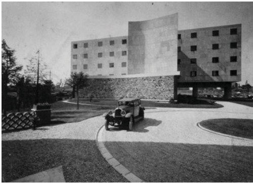
Figure 3: Pavillon Suisse.

Le Corbusier was commissioned to design the Pavillon Suisse in the late 1920's, a gran project far larger than the residences and small pavilions he had previously built. (Figure 3) Like the Pavillon Esprit Nouveau, the Pavillon Suisse was itself a kind of set piece, a building 'type' Le Corbusier believed essential to his various visions of a contemporary city. Heavy, rectilinear, on stilts, it permitted the flow of continuous landscape below it, offering an entry and necessary amenities in a slightly whimsical building slipped under the elevated block. Though soil conditions were not conducive to carrying the enormous weight of the 5-story building on only 6 points, Le Corbusier was eager to build the box-on-stilts model and ordered tremendously deep piles to be drilled.