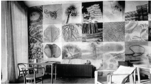
Figure 5: left portion of Pavillon Suisse photomural.

Regarding this request, Le Corbusier noted " J'eus alors l'idée de réaliser, en deux ou trois jours, le premier 'mural photographique,' considéré non pas comme un document mais comme une oeuvre d'art. " 10 The resulting photomural was composed of forty-four square photographs, each approximately one meter by one meter, butted together covering the curved wall of the Pavillon Suisse library floor to ceiling and end to end. (Figure 5). Eighteen or so additional images covered the lozenge-shaped 'column' in the entry hall, next to the staircase (Figure 6). All the photographs on the column were micro-cellular views, most of them white, ghost-like images on a black background. 11