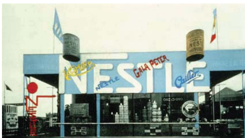
Figure 2: Nestlé Pavilion.

In 1927, the Nestlé Pavilion was built—not as the representation of a new architecture, but as advertisement (Figure 2). Demountable and portable, it traveled from exhibition to exhibition—brightly colored signs artfully collaged into an on-the-ground, walk-thru billboard.